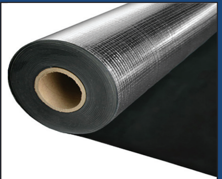
MetroFlex Foil Faced Mass Loaded Vinyl