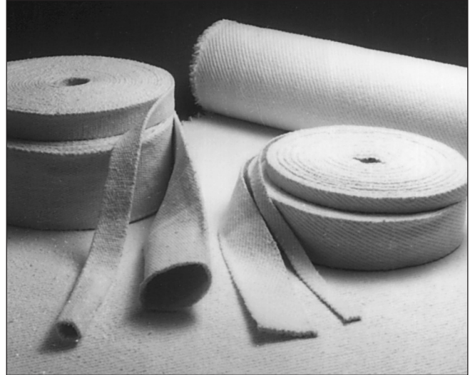
Fiberfrax Cloth, Tape and Sleeving

*Determined by irreversible linear change, not melting point