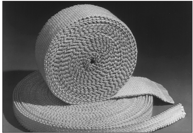
Flexweave 1000 Tape

In addition to the Fiberfrax woven products, the Fiberfrax textile product family also contains a variety of ropes, braids and wicking products. These products are dense, resilient, ceramic fiber materials, widely used for a broad variety of high-temperature gasketing, packing, and sealing applications. For additional details on the available product forms, typical properties or applications for which they are appropriate, refer to Fiberfrax Ropes, Braids and Wicking, Product Information Sheet, Form C-1426.