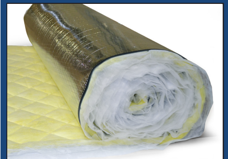
MetroFlex Mass Loaded Vinyl with Fiberglass Absorber/Decoupler